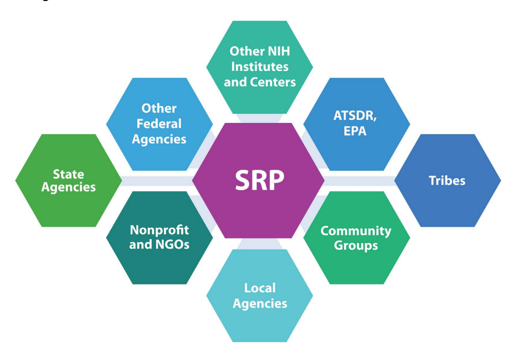
Figure 3: As part of NIEHS within the National Institutes of Health, SRP facilitates partnerships with diverse stakeholder groups in that span and intersect environmental science, engineering, and public health.

SRP recognizes that ongoing interaction with a variety of stakeholders promotes research relevance and leverages crucial resources to ensure that research dollars are used efficiently. Because of the diversity of research in the program, SRP collaborations span from biomedical and human health agencies and programs to environmental science and engineering agencies (Figure 3).