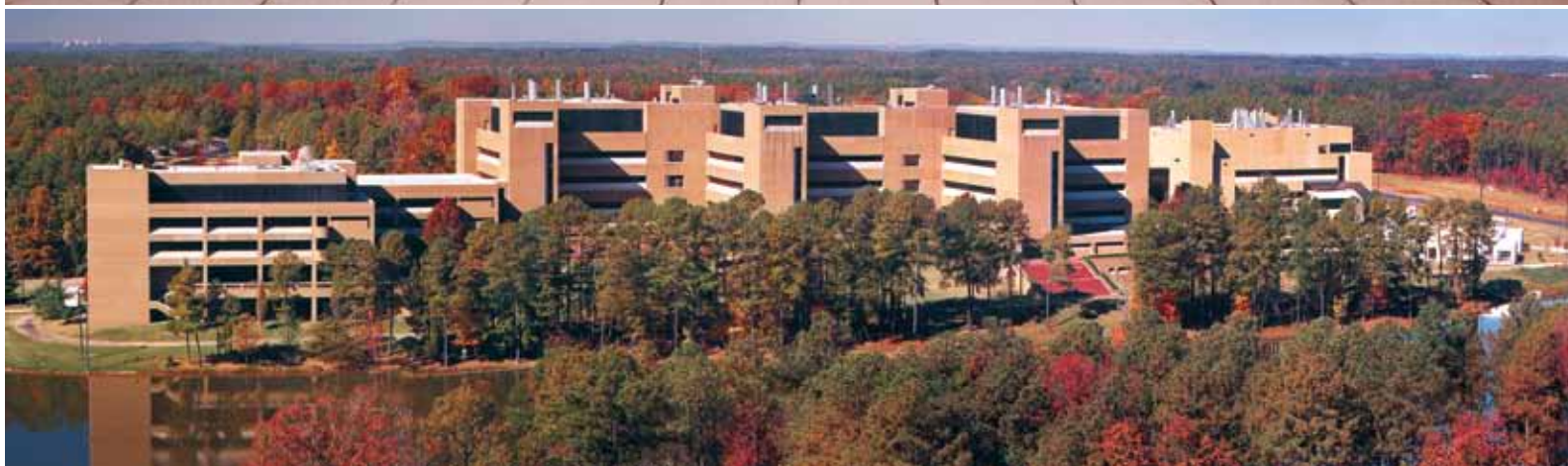
Top: Participants of the WHO/PAHO Collaborating Centers Meeting, 24-26 October, 2011 Bottom: NIEHS Facilities, Research Triangle Park, NC