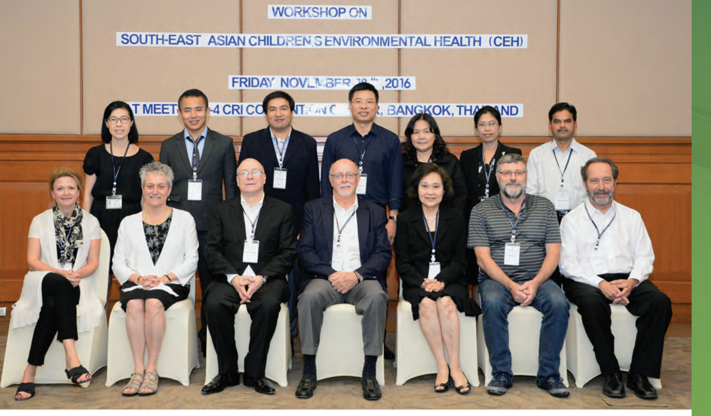
Participants at the CEH Network meeting pose for a photo