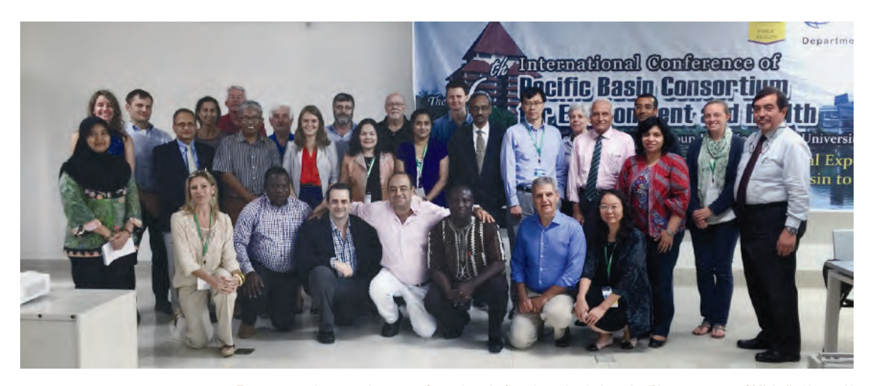
E-waste meeting attendees pose for a photo before departing Indonesia.