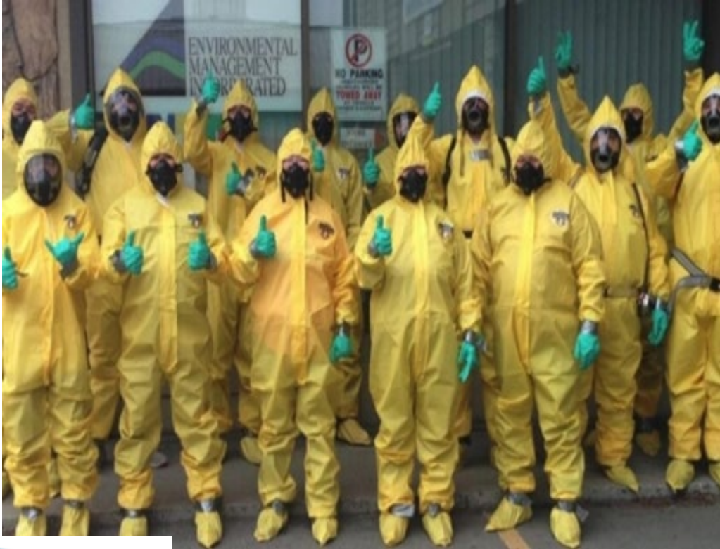
RaceJT- 40 Hr hands-on training