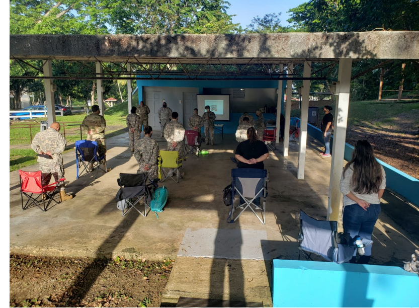
COVID training for first responders was conducted outdoors in San Juan for Unit 51 State and homeland security volunteers.