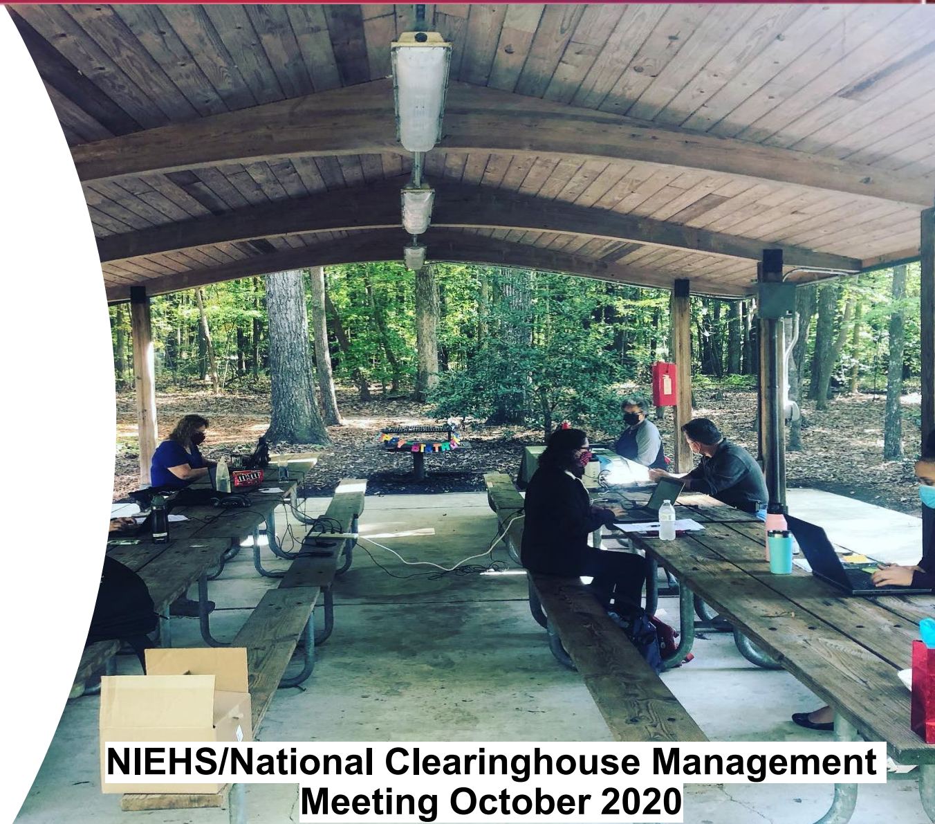
NIEHS/National Clearinghouse Management Meeting October 2020