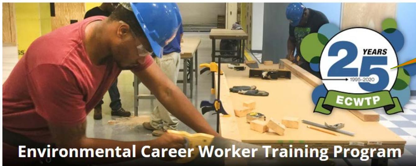
Environmental Career Worker Training Program