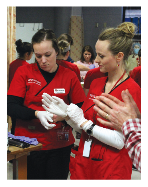
University of Louisville nursing students participate in an operations-level training.

UMET supports responders to disasters and outbreaks through their training in Puerto Rico. UMET provided four-hour PPE for Infectious Diseases courses to responders, facilitating knowledge and skills development in the selection, putting on, and removal of PPE.