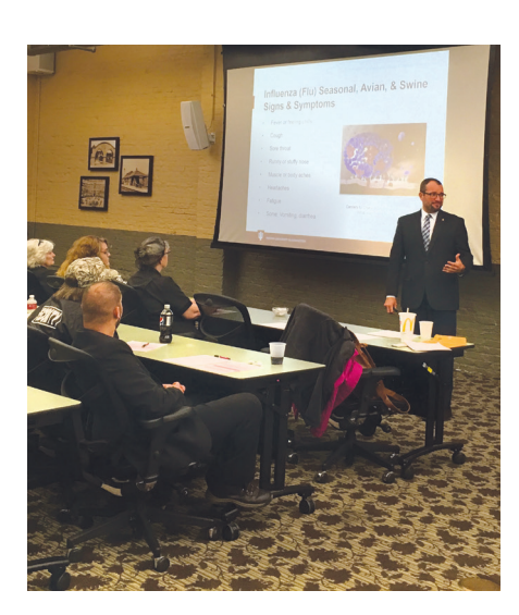
EVS managers and staff of the Indiana casino and resort participate in community-level training from Indiana University Bloomington.

PPE practice session during an operationslevel training with the Alabama State Mortuary Operations Response Team in Tuscaloosa, Alabama. Training was provided by UAB.