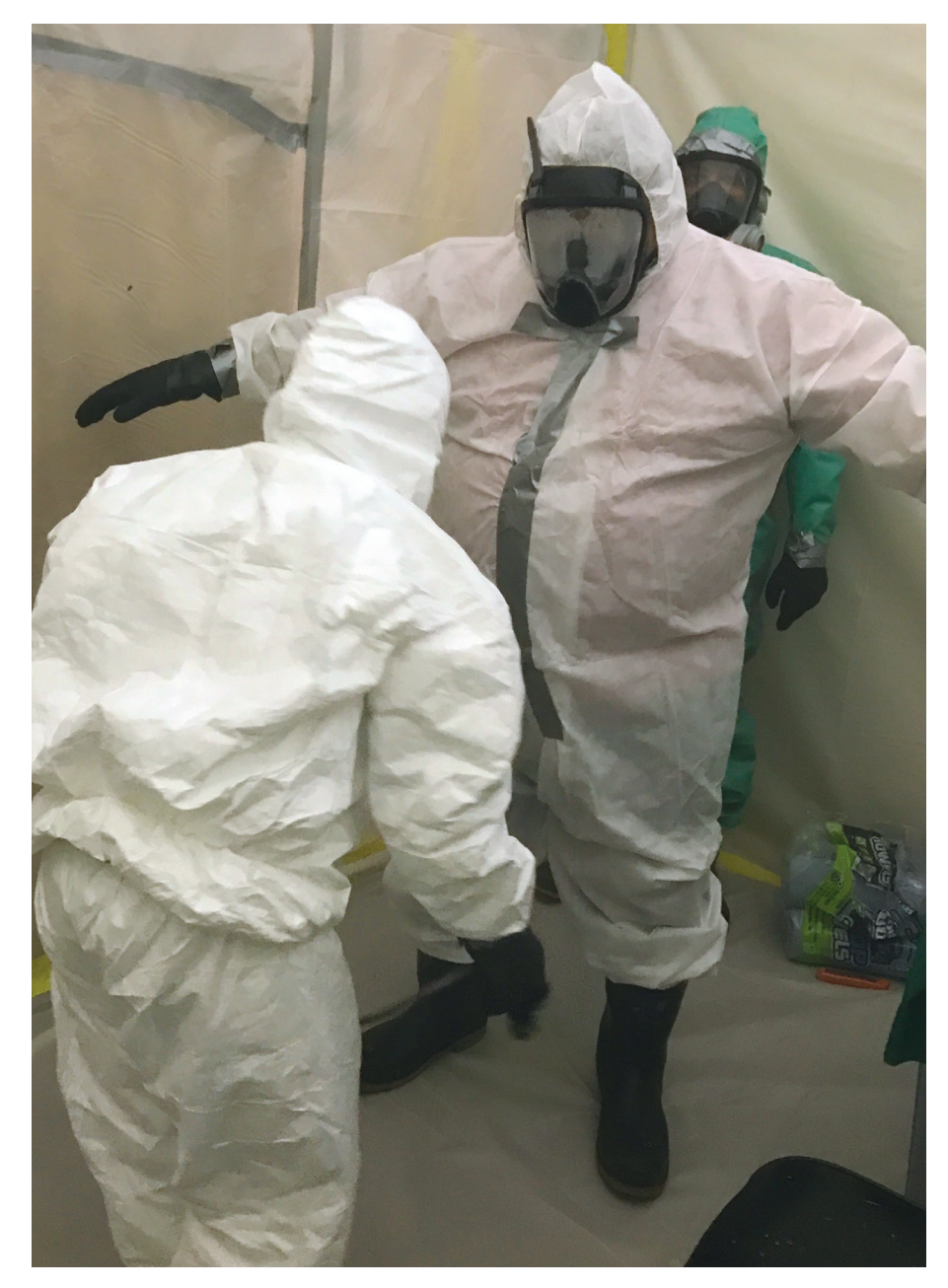
Construction craft laborers learn how to protect themselves against exposure to infectious pathogens.