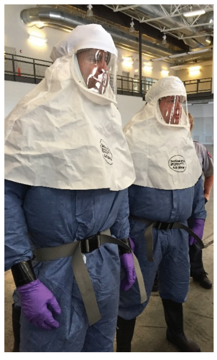
Firefighters at the Omaha Fire Department are trained on PPE by University of Nebraska, consortium member under Indiana University Bloomington.