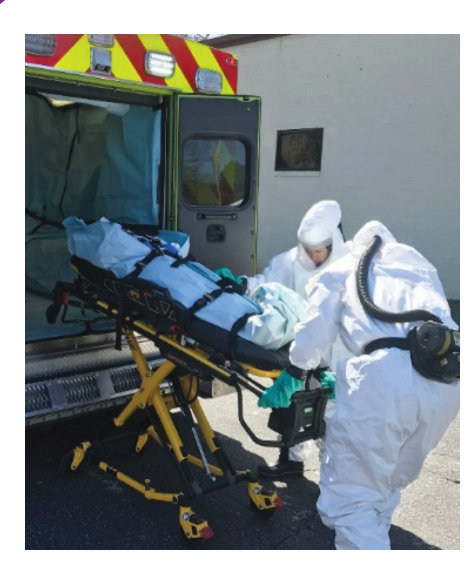
First responders learn strategies for safe transport of potentially infectious patients from the Emory Ebola Biosafety and Infectious Disease Response WTP in Atlanta, Georgia.