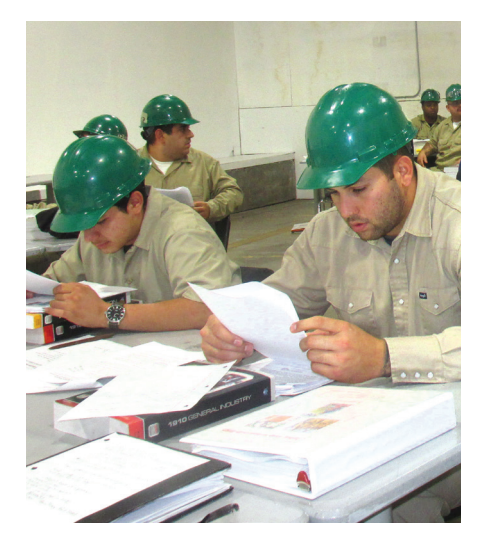
Workers in a pre-apprenticeship program at the Cypress Mandela Training Center in Oakland, California, participate in an infectious disease awareness course.