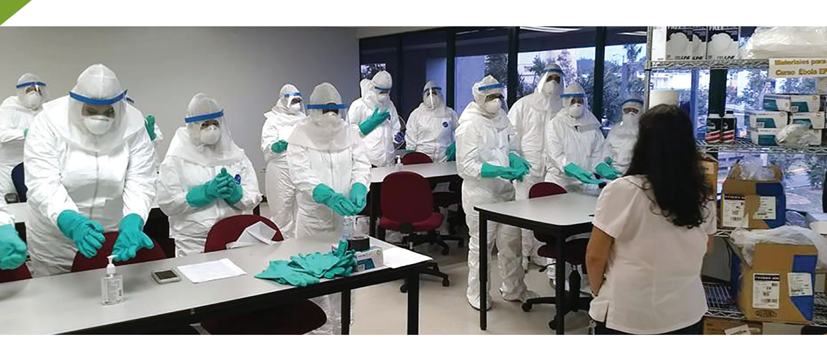
UMET trains health professionals on PPE for infectious diseases in San Juan, Puerto Rico.