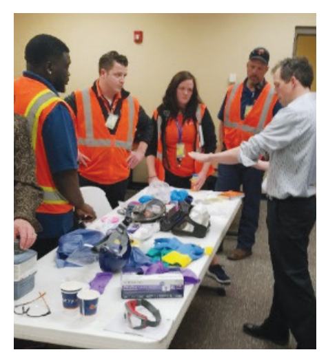
Training for Sun Country Airlines cabin crew by University of Minnesota (UMN).

CWA is training passenger agents and flight attendants on infectious disease health and safety. For passenger agents, they are working with American