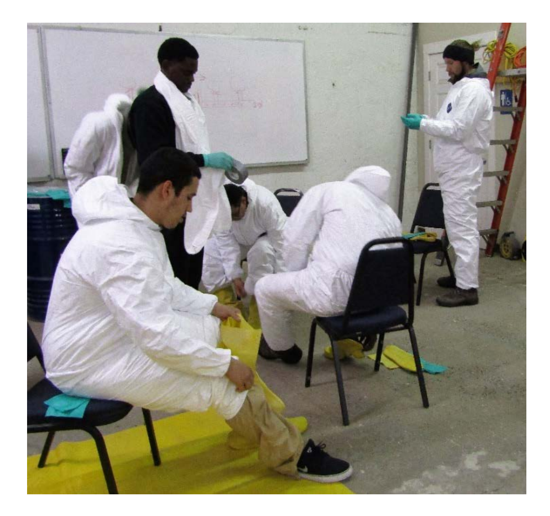
Constructing Hope students prepping for de-con exercise