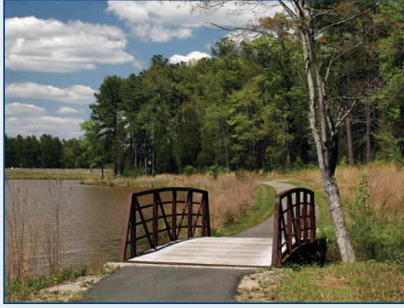
Brochure Prepared by the NIEHS Environmental Awareness Advisory Committee (EAAC)

National Institutes of Health U.S. Department of Health and Human Services