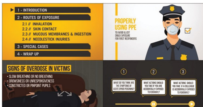
Screenshot from POET videos.

from the pre-video knowledge check. Overall, the videos were well-received by first responders; they agreed or strongly agreed that the videos made them more confident in carrying out their duties on the job.