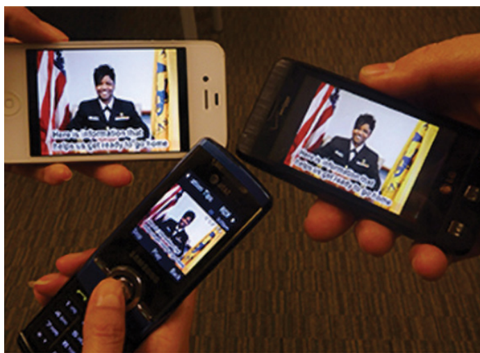
JITTEIS is compatible with messaging on newer and older cell phones.

JITTEIS is a video processing technology that is compatible with newer and older model cell phones. Using the JITTEIS, an incident commander can select relevant training videos from an online dashboard then instruct the system to send them to cell phones of skilled support personnel. Once the videos are copied onto the phone's memory, the cell phone user can play the videos at any time. The process is like text messaging and does not require the user to download any additional applications.