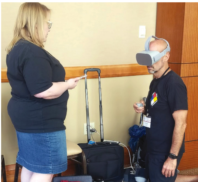
Participant wearing VR goggles during breakout session at 2018 WTP Trainers' Exchange held in Phoenix, Arizona.