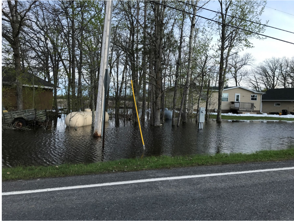
Koochiching County flooding