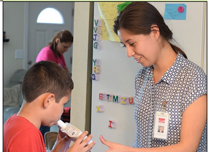
A trained community partner coaches a patient through an asthma test during a home visit.

The research team trained and fostered job skills within local partner organizations, building their capacity to conduct community-based research and enabling them to tackle other challenges within their community.