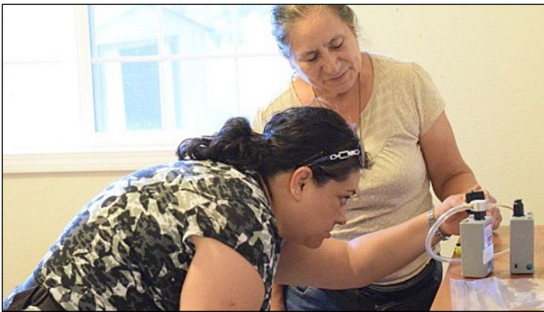
Community partners prepare air pollution monitors.

"The outdoor air monitors were very loud and not acceptable for use indoors in sleeping areas," Karr recalled. "Finding a sensor that was not disruptive or burdensome to the families was crucial to a successful intervention."