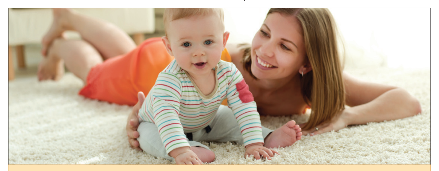
For more information on the National Institute of Environmental Health Sciences, visit https://www.niehs.nih.gov.

Reproduction. DES can alter the way genes are turned on and off in reproductive organs of mice, potentially affecting fertility and reproduction.<sup>12</sup> BPA substitutes have also been linked to similar reproductive issues.<sup>13</sup>