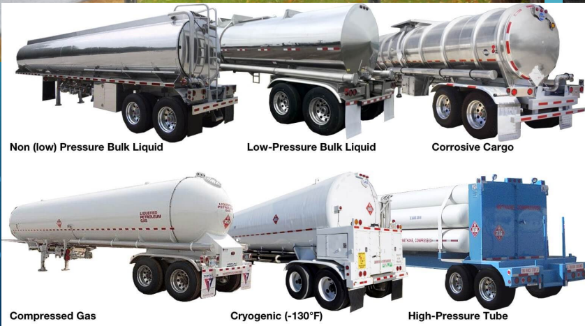
Cargo Tanker Truck Types