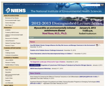
Old Home Page

Launch of NIEHS mobile-ready website June 28. To meet the growing demands of mobile device users in the U.S. and abroad, NIEHS redesigned its public website, so it can be easily viewed and navigated on a broad variety of mobile devices, such as smartphones and tablets. The NIEHS responsive website reformats the page for mobile devices, to retain virtually all the information that would be seen on a desktop monitor. The redesigned site also fully incorporates the use of the new NIH logo and color scheme.