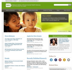
New Home Page