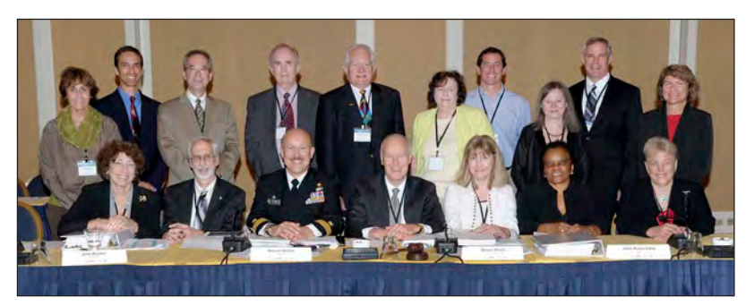
SACATM participants gathered to celebrate the increasing acceptance of alternative testing methods. http://www.niehs.nih.gov/news/newsletter/2011/july/science-steady/index.cfm

In its advisory role to the Interagency Coordinating Committee on the Validation of Alternative Methods (ICCVAM) and the NTP Interagency Center for the Evaluation of Alternative Toxicological Methods (NICEATM), SACATM