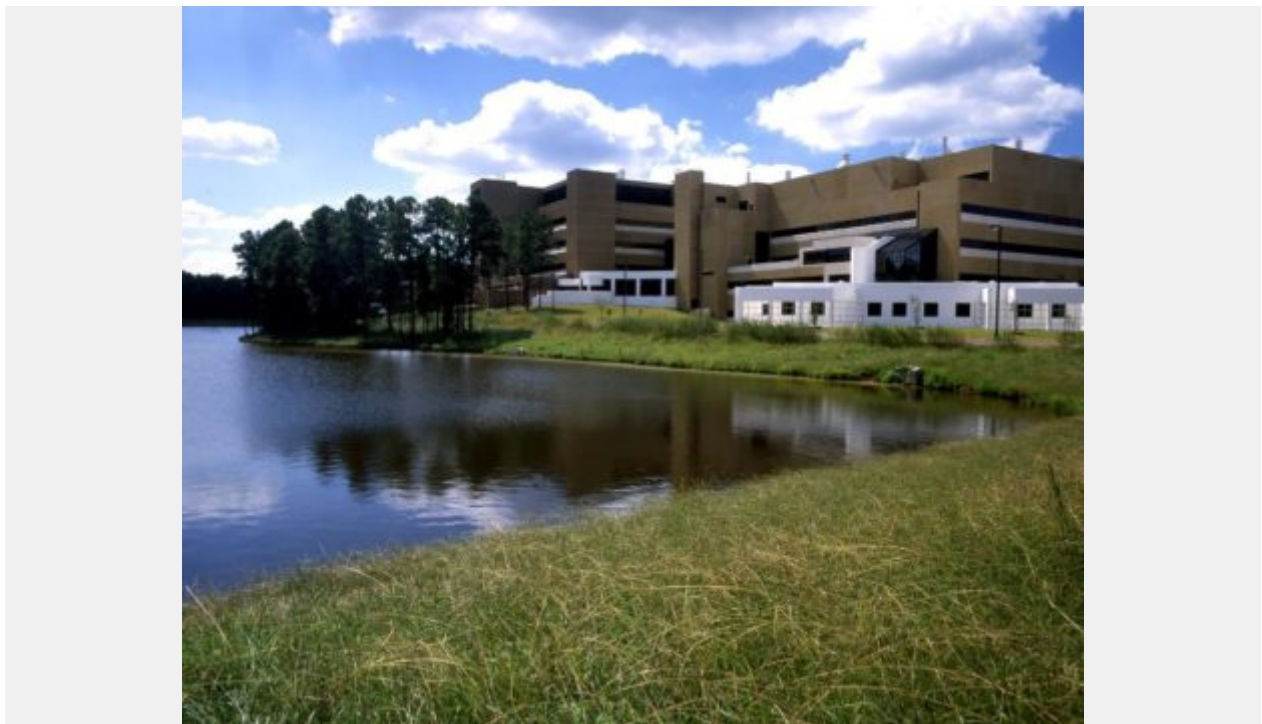
NIEHS' campus in Research Triangle Park.

Having NIEHS and an Environmental Protection Agency campus in RTP has made the Triangle region an international leader in environmental sciences. “It’s also been a major job creator,” said Price, one of multiple members of Congress who have advocated for continued federal support for both agencies.