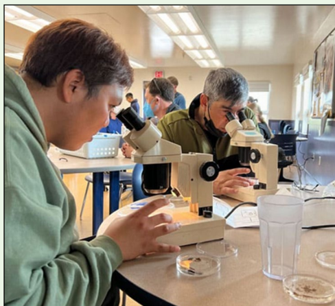
Environmental Health Research Institute participants receive laboratory trainings.

ACAT established the Environmental Health Research Institute to provide the community with the tools necessary to conduct their own community-based environmental sampling program. The Institute brings together tribal leaders and community members from around Alaska for a weeklong intensive program to gain knowledge and hands-on experience on a variety of topics, including water quality testing, fish sampling, sediment coring, and GIS computer mapping. The college-credited course also gives participants the opportunity to learn from environmental health experts about how environmental contaminants may affect human health, and how to implement independent community-based environmental sampling programs in their villages.