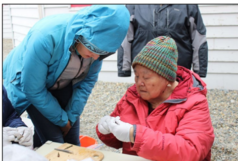
ACAT staff member and a tribal member dissect fish for analysis in Sivuqaq.

ACAT runs programs to educate and train health care providers, including community health aides, who are the frontline health care system in most rural Alaskan communities. The training includes monthly webinars for more than 200 people, covering topics such as flame retardant chemicals and their health effects, presentations at hospitals and health care centers, and training at statewide health conferences. Participants can obtain continuing medical education through these trainings.