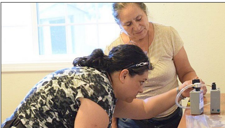
Community partners prepare air pollution monitors.

"The outdoor air monitors were very loud and not acceptable for use indoors in sleeping areas," Karr recalled. "Finding a sensor that was not disruptive or burdensome to the families was crucial to a successful intervention."