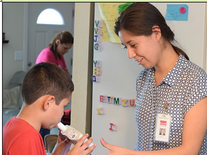
A trained community partner coaches a patient through an asthma test during a home visit.

The research team trained and fostered job skills within local partner organizations, building their capacity to conduct community-based research and enabling them to tackle other challenges within their community.